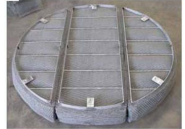
Mesh Demister Type RHO-145-9030 Pad tck 150mm - MOC 316L Column Ø 1600mm