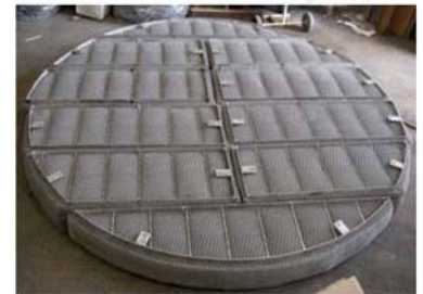
Mesh Demister Type RHO-145-9030 Pad tck100mm - MOC 304L SS Column Ø 2800mm

Mesh pad mist eliminators remove liquid droplets by impingement of the droplets on the wire surface. The droplets agglomerate and increase in size until they are sufficiently large enough to drain from the pad by gravity.