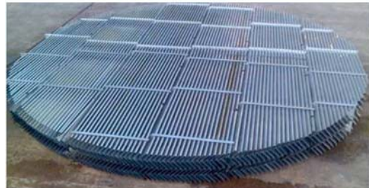
Vane Demister Type 4-1- WH Column Ø 2700mm MOC 316L

With smooth profile blades typical removal efficiency is 100% removal of droplets 17µm and greater in diameter. Using blades with hooks the normal removal efficiency is 100% of droplets 10µm and greater in diameter.