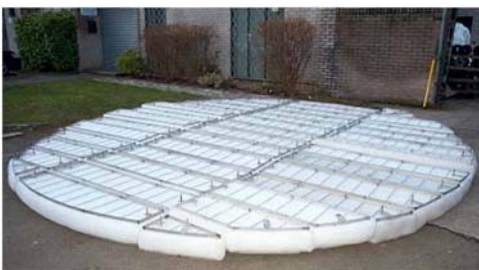
Mesh Demister Type RHO-100-PP-9008 Pad tck 150MM - MOC: PPL Column Ø 6500mm

Mesh pads are typically 150mm thick with 25mm thick grids on either side making an overall thickness of 200mm. Many years of experience have shown that a 150mm pad thickness provides optimum performance in hydrocarbon processes with a vertical gas flow configuration.