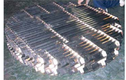
Vane Demister Type 3-2-NH 1600--2400mm Ø IPA Absorber Column MOC Nickel200