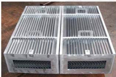
Vane Pack Type 4-1- WH Face Area 1800mm x 2000mm MOC304L

With smooth profile blades typical removal efficiency is 100% removal of droplets 17µm and greater in diameter. Using blades with hooks the normal removal efficiency is 100% of droplets 10µm and greater in diameter.